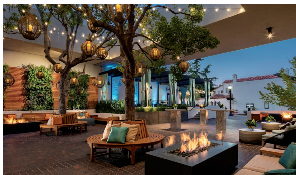
Monterey Marriott | Monterey, CA

CSDA's 2023 Annual Conference & Exhibitor Showcase is back in Monterey! Attendees can enjoy meandering down Cannery Row and Monterey Old Fisherman's Wharf to indulge in a piping hot bread bowl full of clam chowder, visit the acclaimed Monterey Bay Aquarium to see a spirited sea otter up-close, or book a boat tour, whale watching cruise, or fishing trip to set sail on the open waters of Monterey Bay. In your free time, enjoy the combination of natural beauty and cultural richness of Monterey!