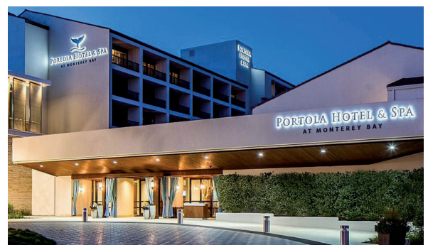
Portola Hotel & Spa | Monterey, CA

CSDA room reservations in the CSDA room block at the Marriott and Portola Hotel & Spa are available starting at the rate of $229 plus tax. The room reservation cut-off is August 5, 2023; however, space is limited and may sell out before this date. Information regarding hotel reservations and link to book in the CSDA room block will be emailed to the registrant within 24 hours of registration.