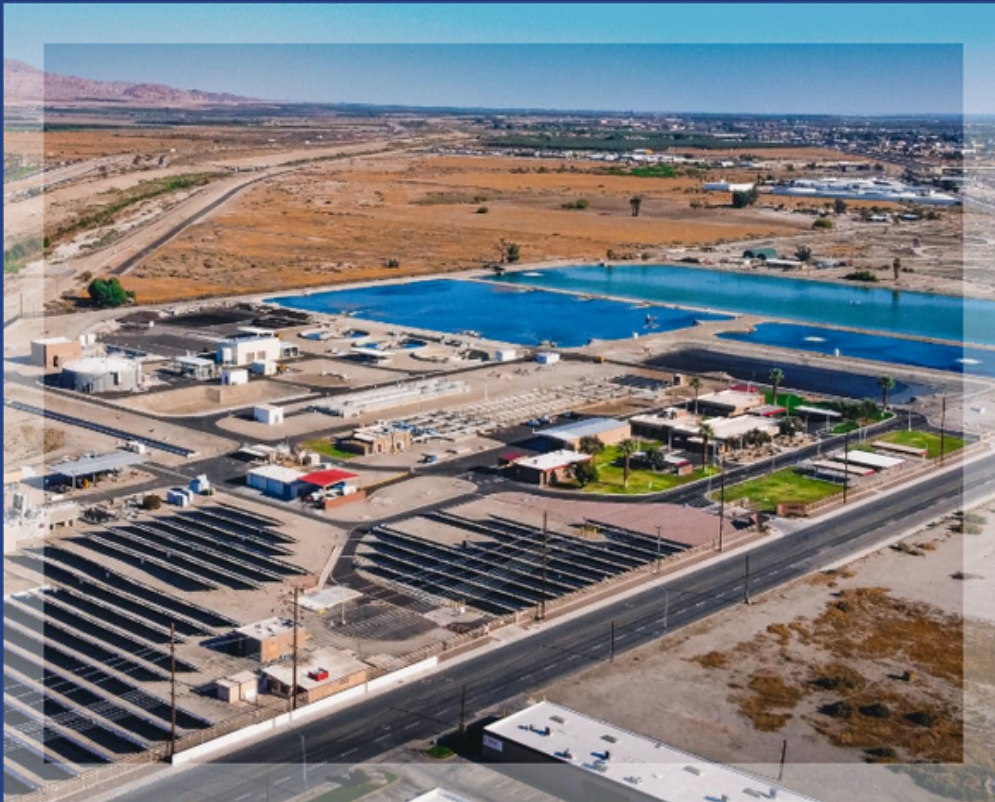
Aerial view of Valley Sanitary District's Water Reclamation Facility and administration building.